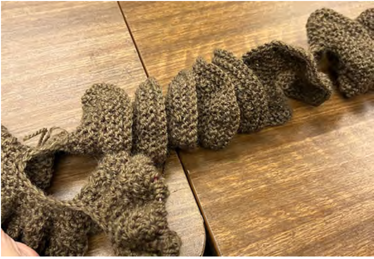
Myra W. in the process of binding off #@*&! stitches of the potato chip scarf she is knitting for her niece.