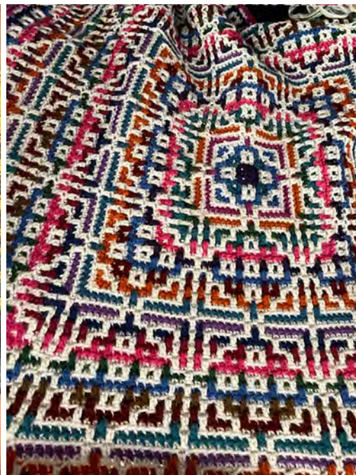
Valerie C.'s mosaic crochet lapghan is almost finished.