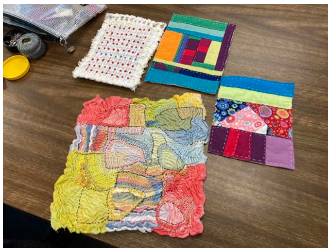
Sheryl K.'s pieced and stitched fabric collages